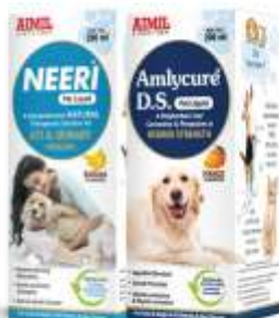
ANIMAL HEALTH PRODUCTS