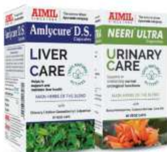
GLOBAL RANGE OF HEALTH SUPPLEMENTS