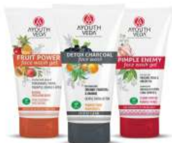
PERSONAL CARE PRODUCTS